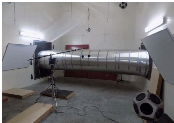
Figure 2. A sound room measures insertion loss after acoustic insulation is applied, per ISO 15665.